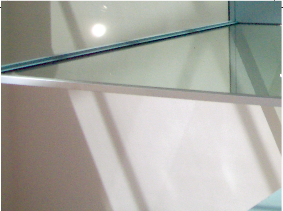
Yamaoka Yasuhiro Music for an Exhibition