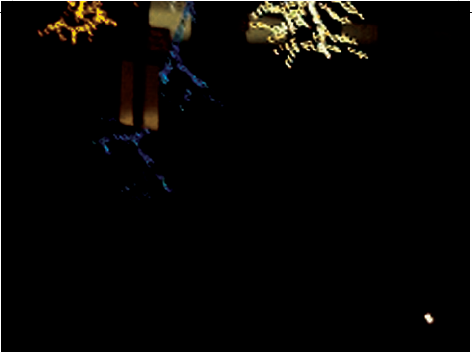
Yamaoka Yasuhiro Out of the Room